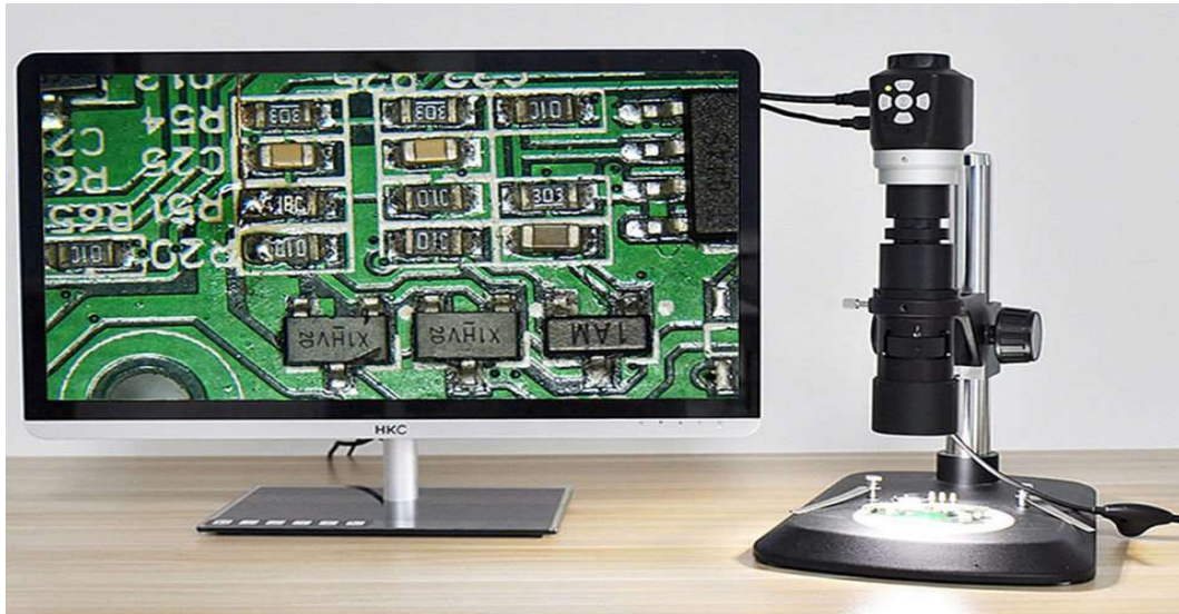
Figure: illustrative purpose only

Monocular, continuous zooming, optical inspection system with a high definition colour CCD camera along with Visual inspection system required for PCB Inspection applications