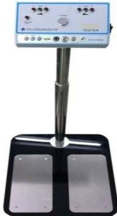
Figure : illustrative purpose only

With dual foot plate, foot plate cord, Ground cord, Power adaptor etc. With Audio visual alarm, Height: approx.: 1 meter, ESDA Compliant