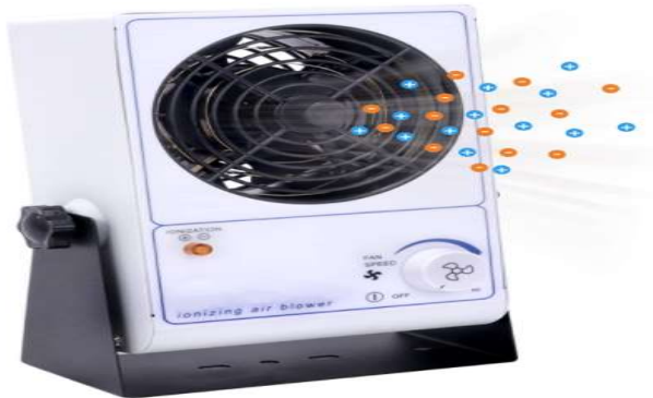
Figure: illustrative purpose only