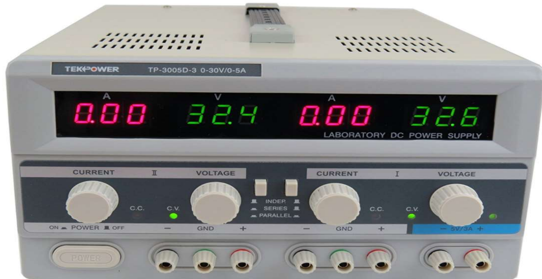
Figure: illustrative purpose only

+/- 10% Variation in the Voltage, Frequency, Power rating range is permissible