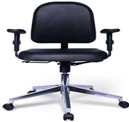
Figure: illustrative purpose only

Colour of fabric: ( Grey, Black , Blue colour – preferable