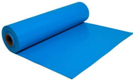
Figure: illustrative purpose only

(As per the room size: 6X 6 Mtr), Preferably Blue Colour, BIS approved Brand / ISI Mark ESD Compliant mat shall be used.