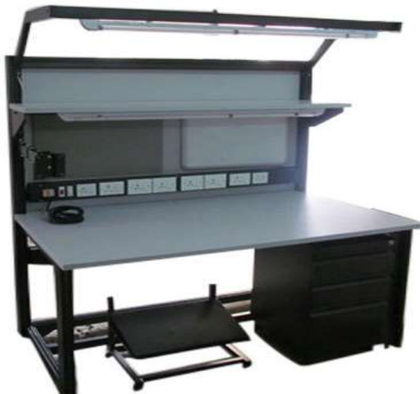
Figure:: illustrative purpose only