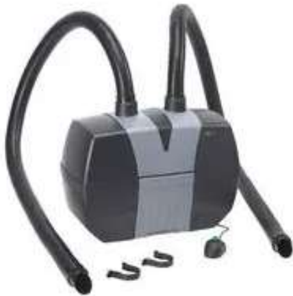
Figure : illustrative purpose only