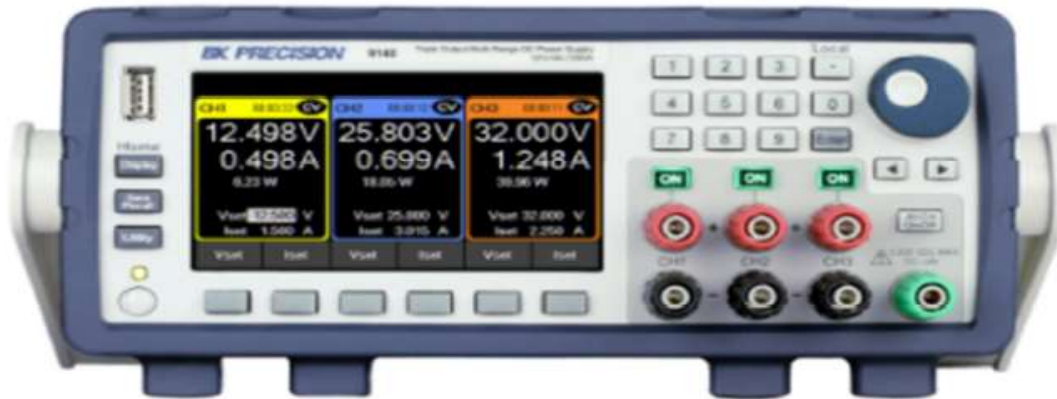
Figure: illustrative purpose only