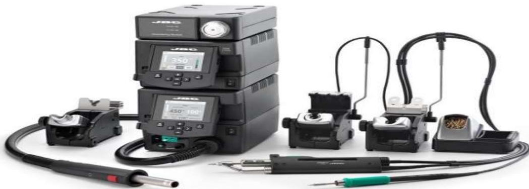
Figure: illustrative purpose only